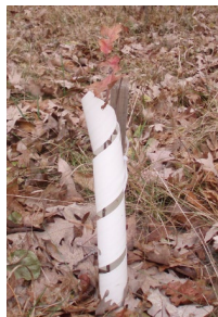
Tree guard installed using wooden stake and zip tie.