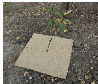
Tree square installed around a seedling